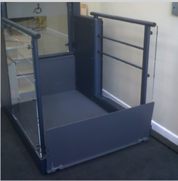
Full Height Side Panels