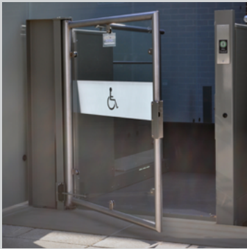
Manual / Power Gates