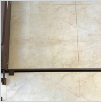
Special Floor Covering