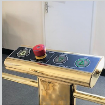
High Specification Controls