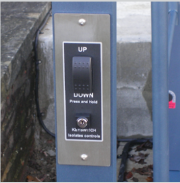
Key Switched Controls